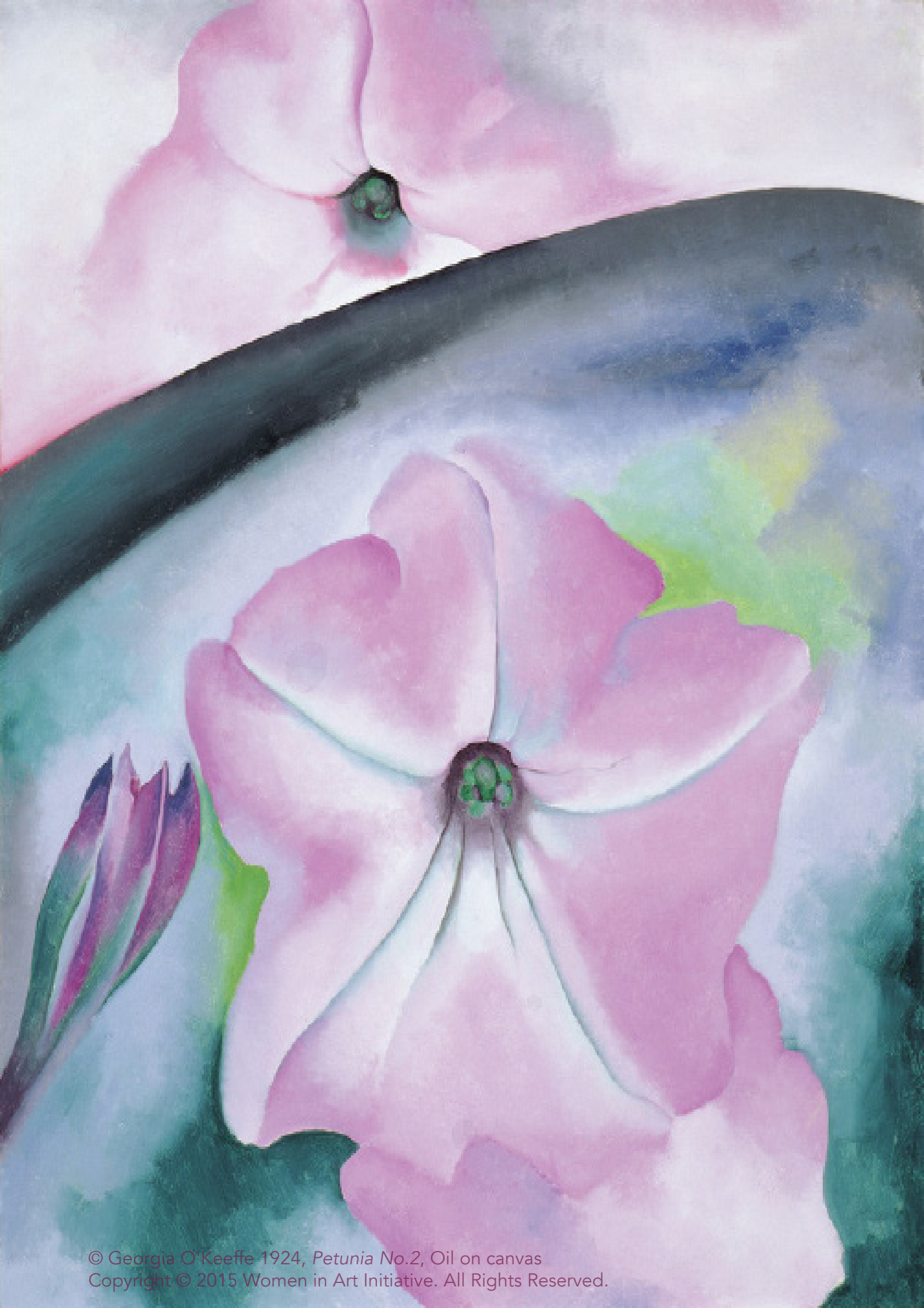
© Georgia O'Keeffe 1924, Petunia No.2 , Oil on canvas